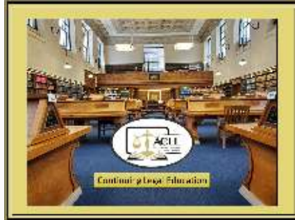
We are Recording all New Live / Zoom CLEs